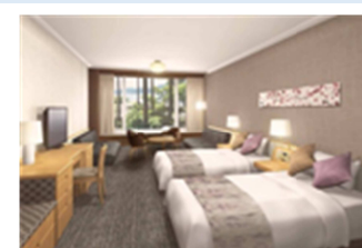
Guest room image of The Prince Hakone Hakone Lake Ashinoko

The Prince Hakone Lake Ashinoko and 2 other facilities are located in the Hakone area where famous for Japan's leading hot spring resort will be reopening with newly equipped hot spring facility, guest rooms, and restaurant to value-up guests' stay at our "Onsen (hot spring)" that also enables the guests to enjoy the traditional scenic views of Hakone to the maximum.