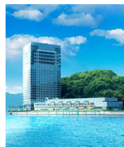
Grand Prince Hotel Hiroshima