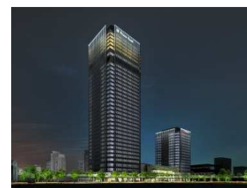
Global Gate Image

The hotel is equipped with 170 guest rooms, restaurants, club lounge, fitness, business center and other facilities.