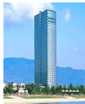
Lake Biwa Otsu Prince Hotel