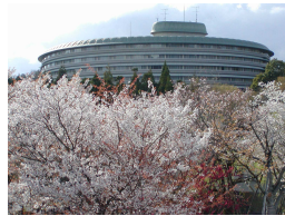
Grand Prince Hotel Kyoto