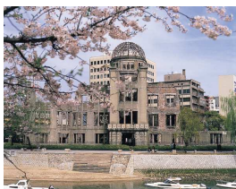
Hiroshima Peace Memorial Park

Hiroshima Peace Memorial park is a big park located in the center of Hiroshima built near the hypocenter to wish for the eternal world peace. This beautiful park surrounded by the river and green trees has approximately 300 sakura trees. The best time to visit is from the end of March to the beginning of April.