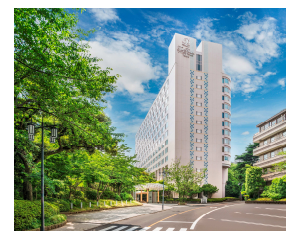
Exterior appearance of the hotel

[Telephone] +81(0)3-5798-1111 (representative)